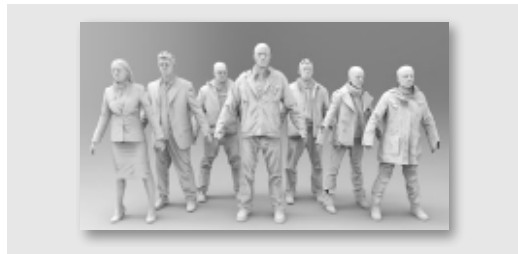
World War Z – People