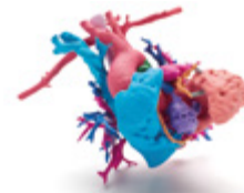
Data courtesy of FreshFiber